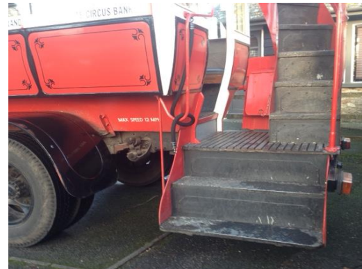
Fig. 28 – Steps to access Veteran Bus