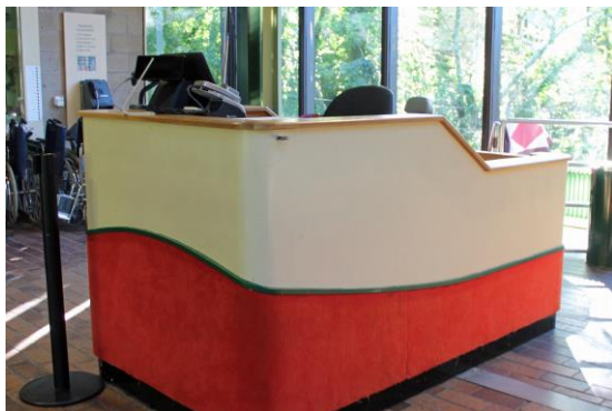
Fig. 3 – Customer till point.