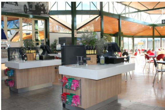
Fig. 9 – Till points in Brabazon restaurant