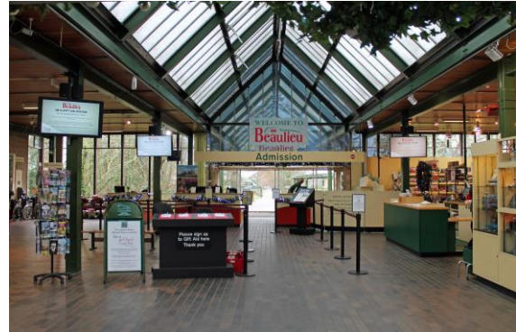
Fig. 2 – Interior of Visitor Reception