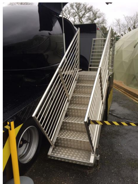
Fig. 18 – Steps to the Top Gear simulator