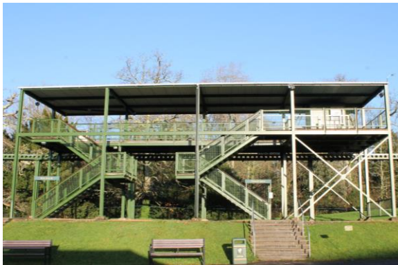
Fig. 27 – North Monorail Station