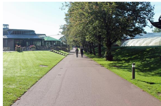
Fig.4 – Main pathway leading through site.