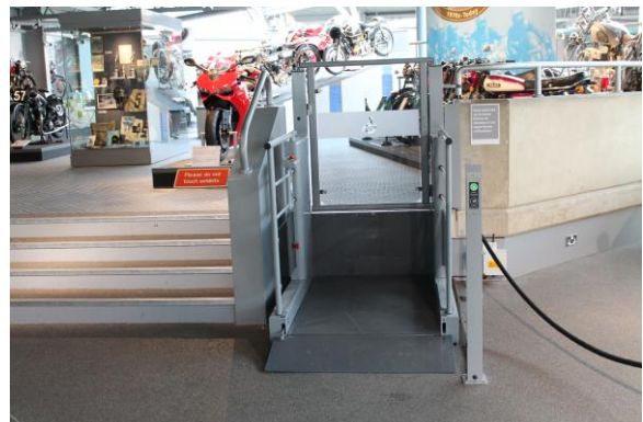
Fig. 10 – Lift for steps on mezzanine level