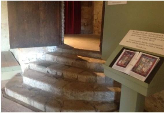
Fig. 25 – Stairs up to Domus (no handrail). Image book of Domus.