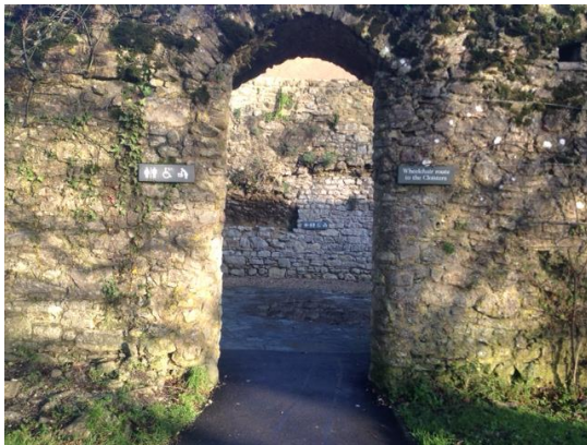
Fig. 21 – Wheelchair access route for the Abbey and Domus