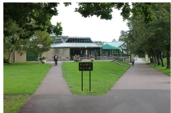
Fig.6 – Access to Brabazon restaurant from main pathway.