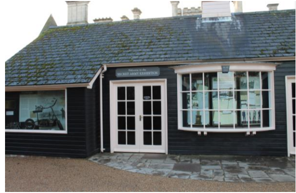
Fig. 26 – Entrance to Secret Army Exhibition