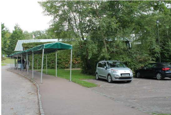
Fig. 1 – Main pathway from disabled car park to Visitor Reception.