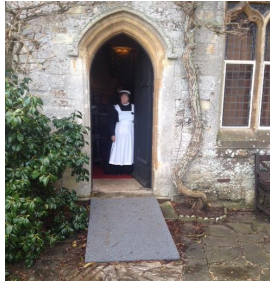
Fig. 20 – Private entrance to allow access to lower floor of Palace House.