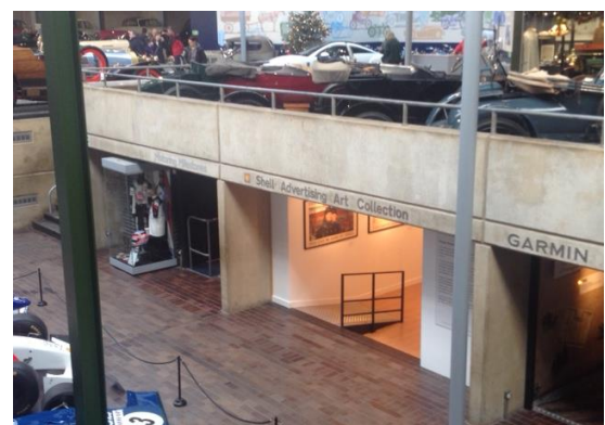
Fig. 12 – Example of booths and ramp access