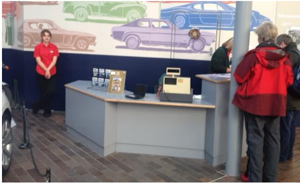
Fig. 13 – Information desk in the museum with DVD player