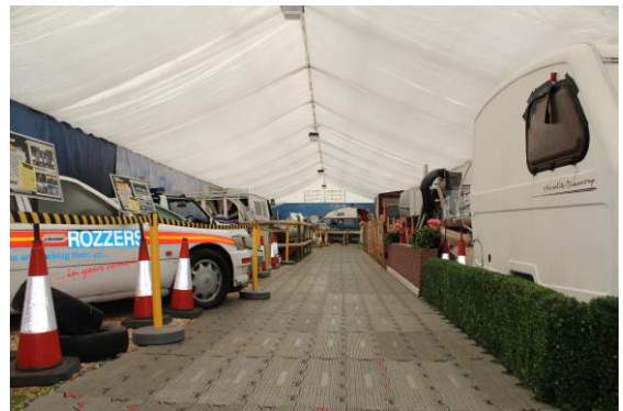
Fig. 16 - Plastic footway in the Top Gear marquee exhibition space