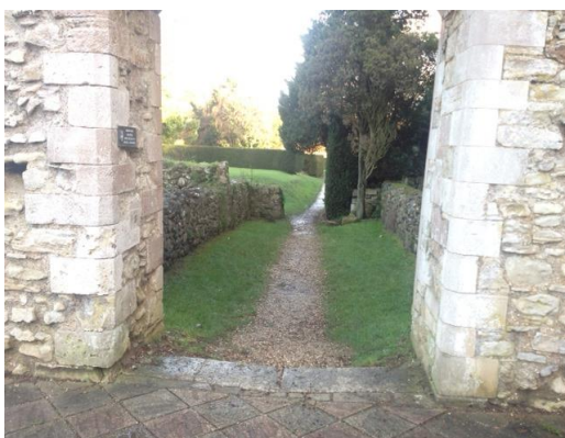
Fig. 23 – Additional compact gravel pathways leading through ruins