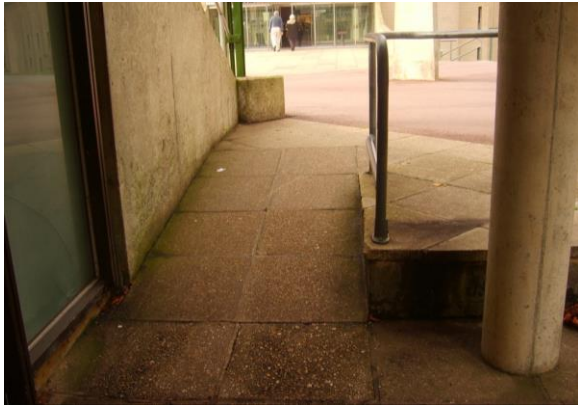
Fig. 7 – Entry to accessible lavatories from main pathway.