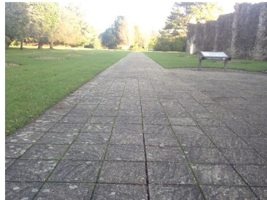
Fig. 22 – Paved ground surface around the Abbey & Cloister