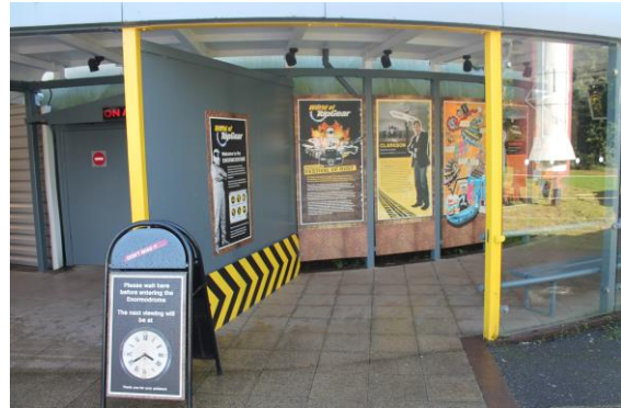
Fig. 14 – Paved walkway to the Top Gear Enormodrome