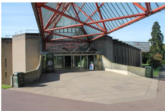
Fig.5 – Access to National Motor Museum from main pathway.