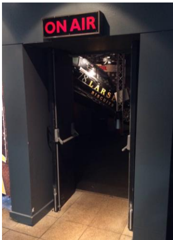
Fig. 15 – Top Gear entrance doors