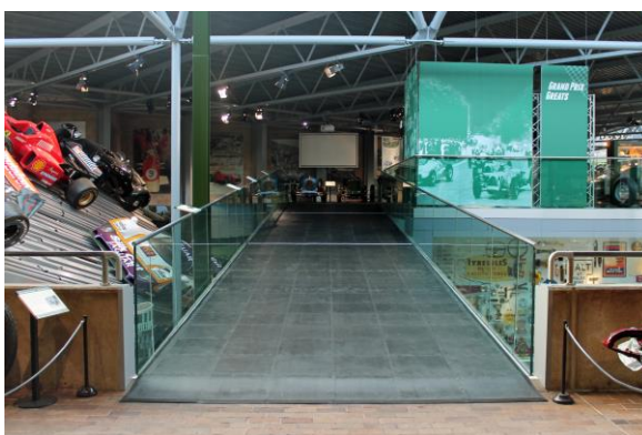
Fig. 11 – Ramp to mezzanine level