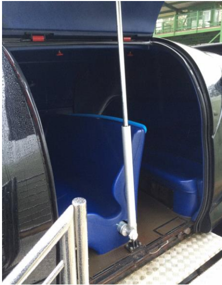
Fig. 19 – Door to the Top Gear simulator