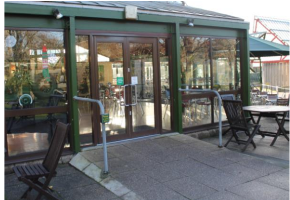
Fig. 8 – Power assisted doors to Brabazon restaurant.