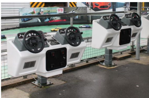
Fig. 17 – Lowered control panel for World of Top Gear Test Track Challenge