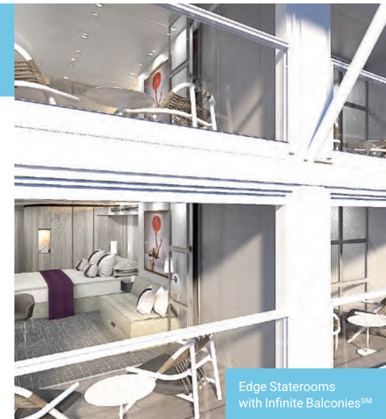
Edge Staterooms with Infinite Balconies SM

Deluxe Ocean View Stateroom W/ Balcony 1A Deluxe Ocean View Stateroom W/ Balcony 1B Premium Ocean View Stateroom 10 Deluxe Ocean View Stateroom 06 Ocean View Stateroom 07 Ocean View Stateroom 08 Deluxe Interior Stateroom 09 Deluxe Interior Stateroom 10 Deluxe Interior Stateroom 11 Interior Stateroom 12