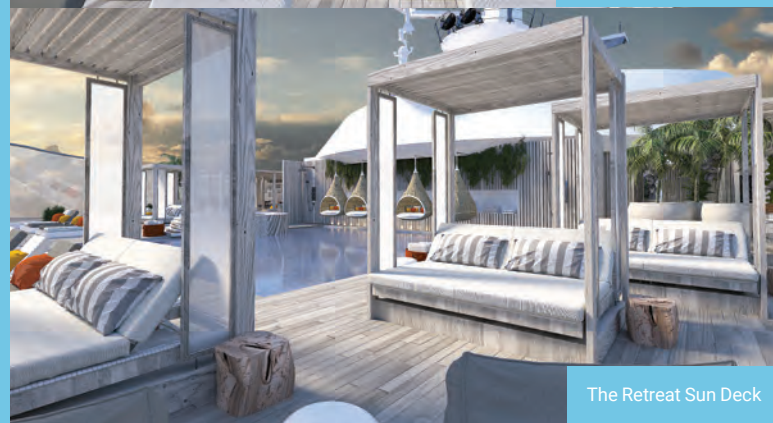
The Retreat Sun Deck