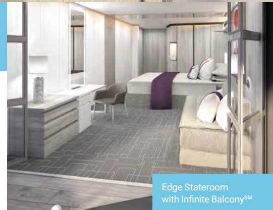
Edge Stateroom with Infinite Balcony SM