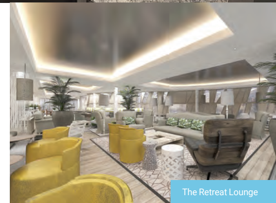
The Retreat Lounge