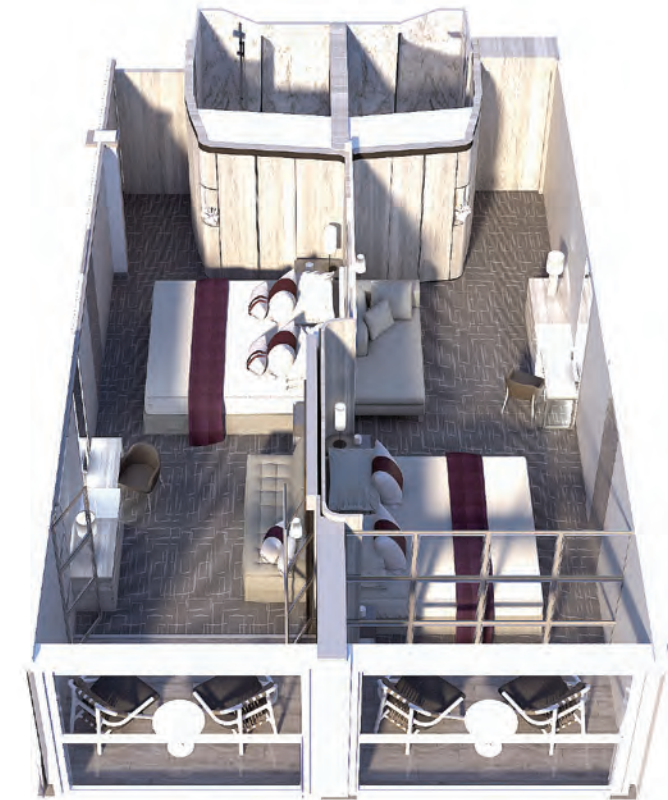
Edge Stateroom with Infinite Balcony SM plan

So what's new? Well, we've made almost 70% of the staterooms larger. Plus our new Edge Staterooms offer (wait for it), INFINITE BALCONIES SM ! Never before seen at sea – they're a first for us, and in the cruise industry.