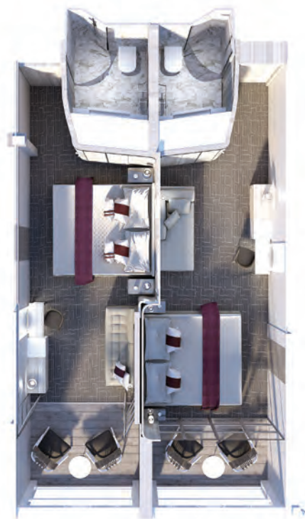
Edge Stateroom plan

So what's new? Well, we've made almost 70% of the staterooms larger. Plus our new Edge Staterooms offer (wait for it), INFINITE BALCONIES SM ! Never before seen at sea – they're a first for us, and in the cruise industry.