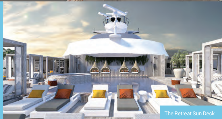
The Retreat Sun Deck