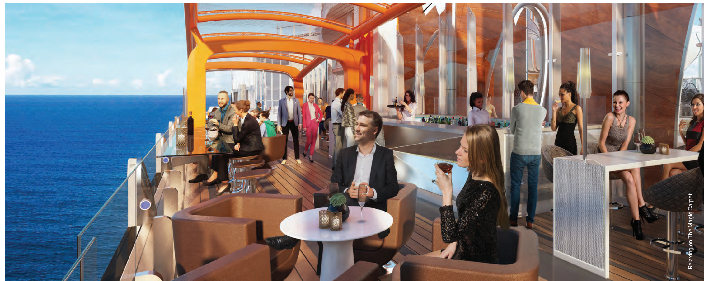
Relaxing on The Magic Carpet