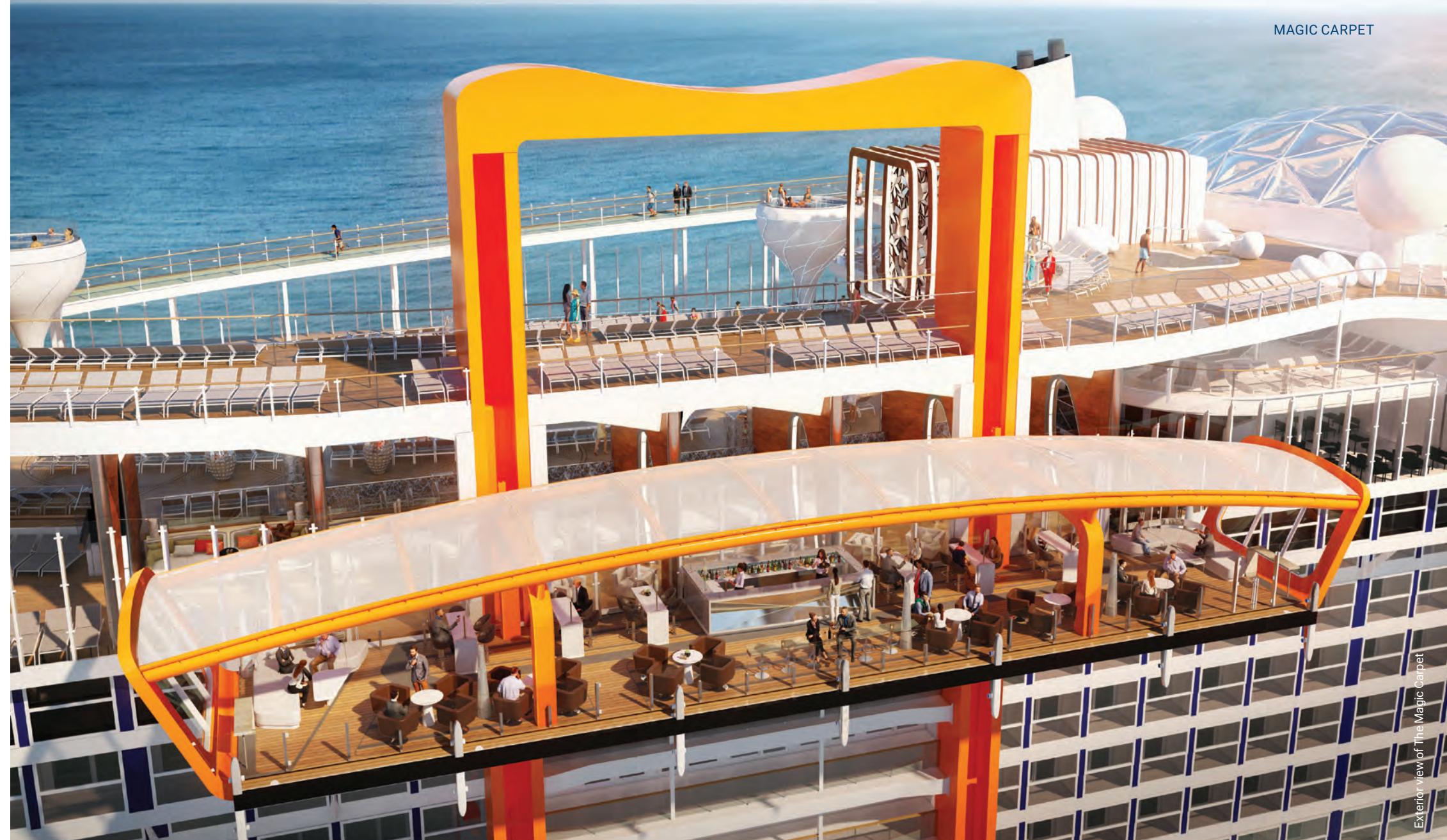
Exterior view of The Magic Carpet