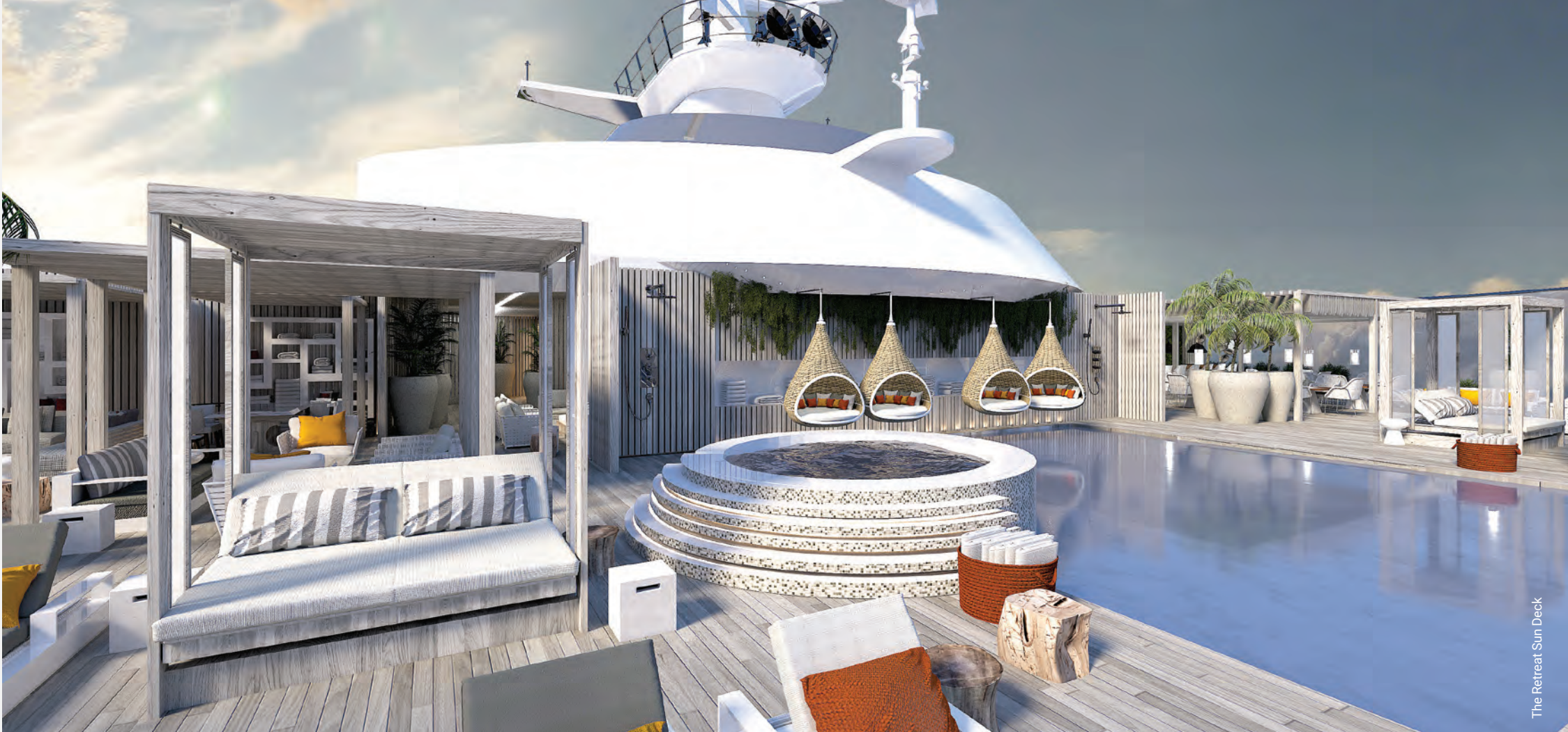
The Retreat Sun Deck