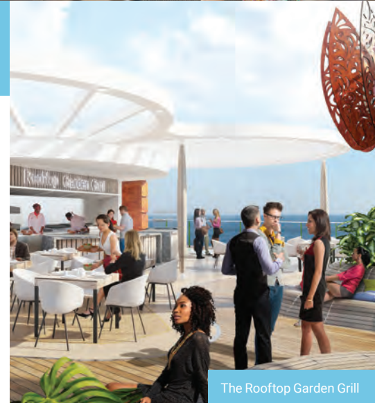
The Rooftop Garden Grill