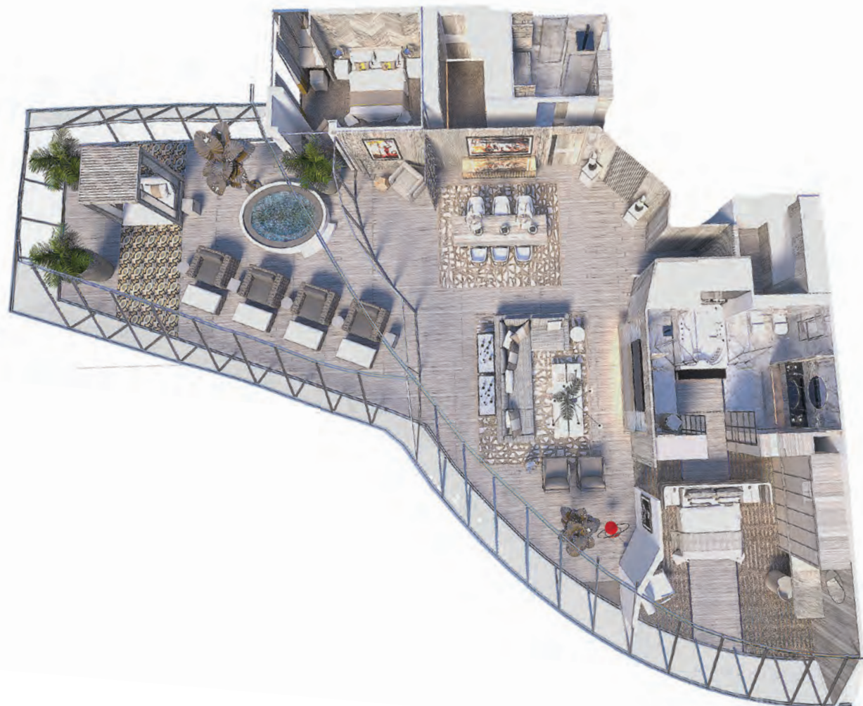
Iconic Suite plan