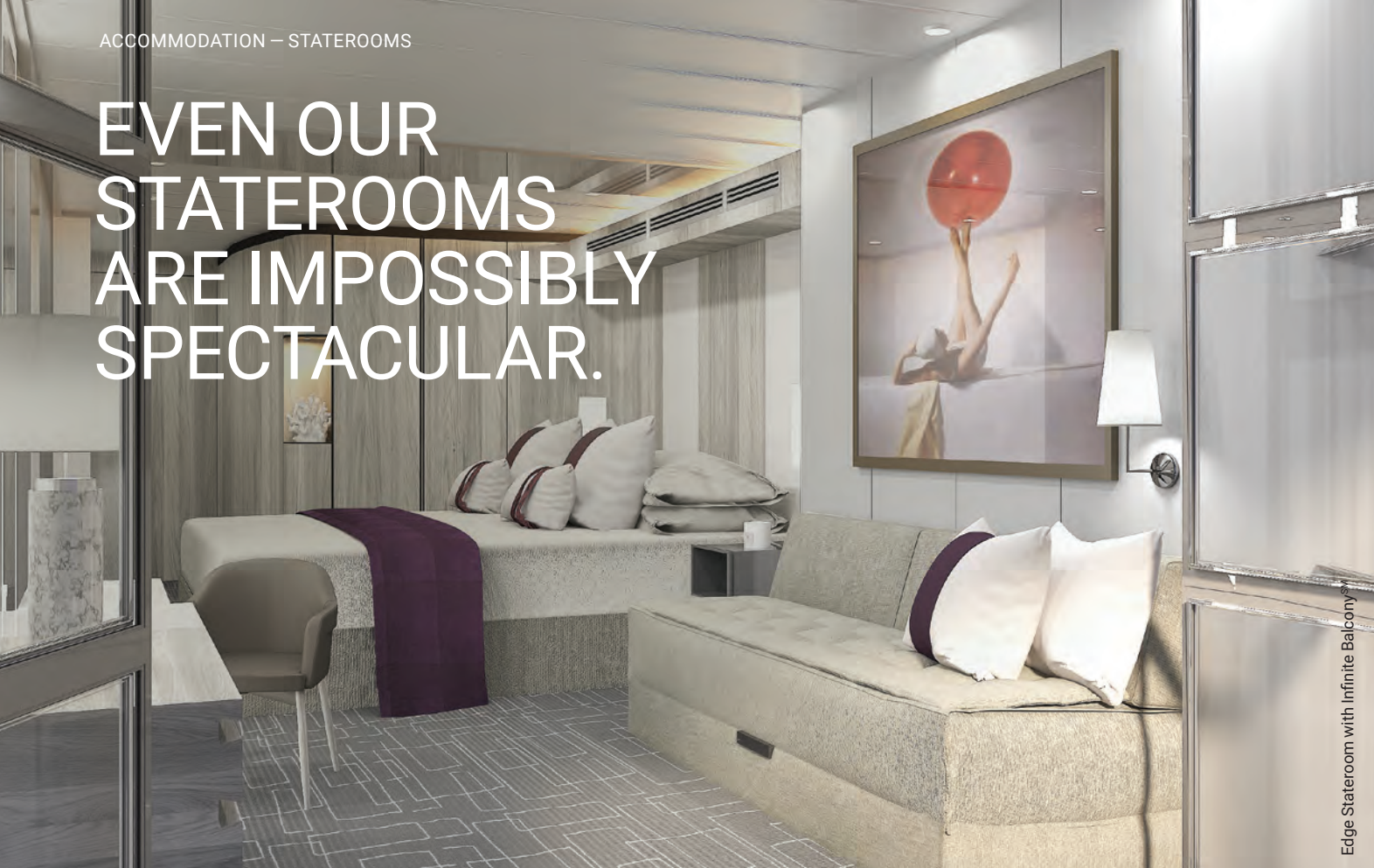
Edge Stateroom with Infinite Balcony SM