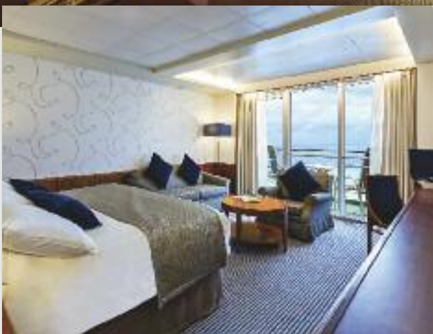
Junior Balcony Suite Navigator Deck 11