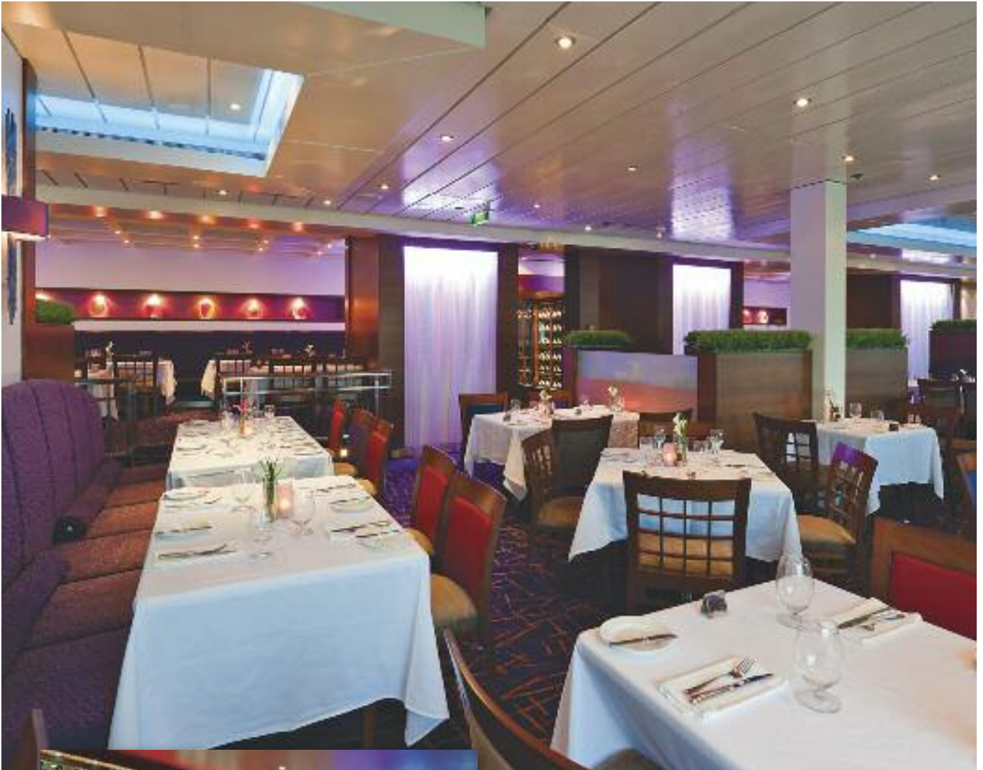
Waterfront Restaurant Promenade Deck 7