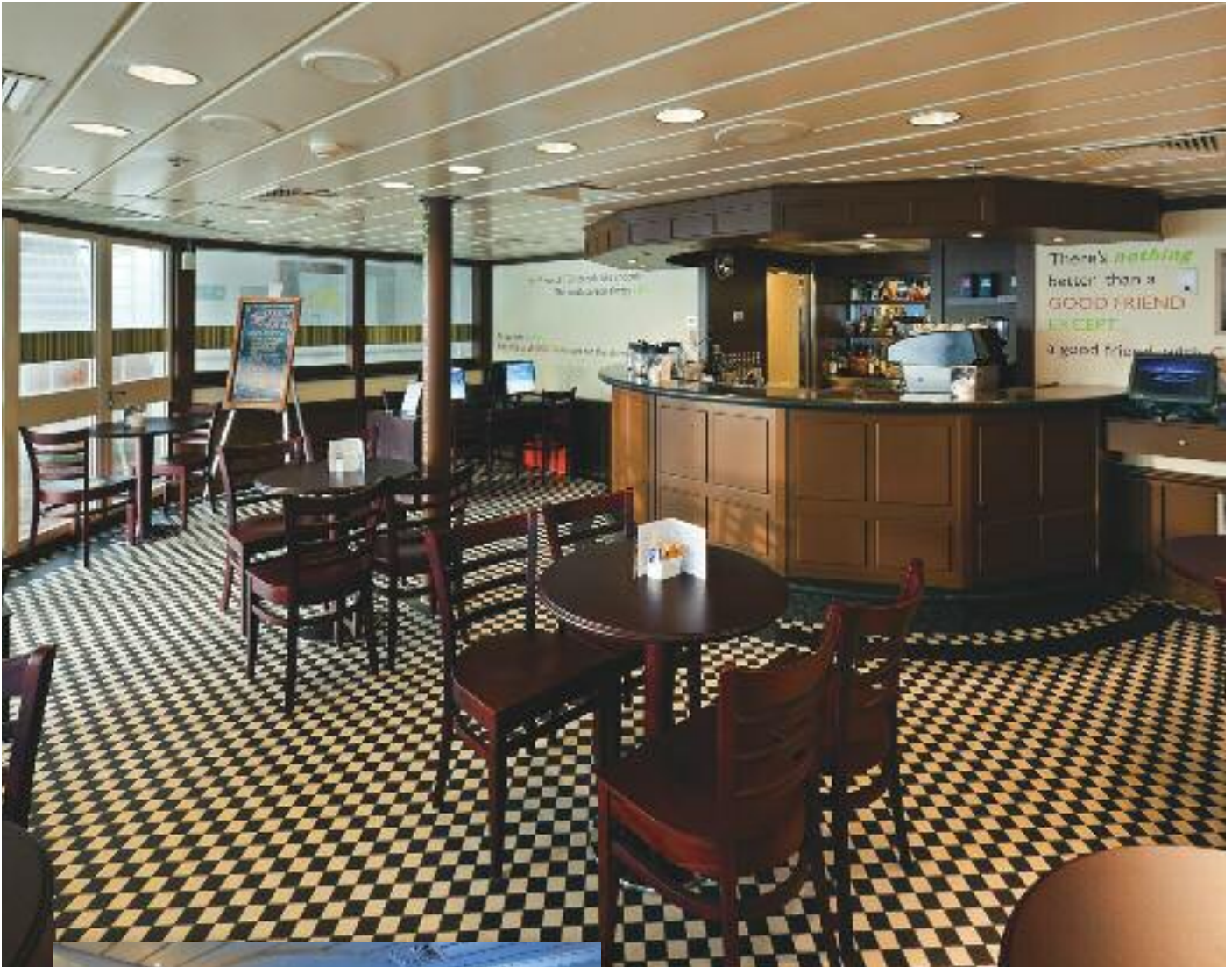
Cappuccino's Lido Deck 12