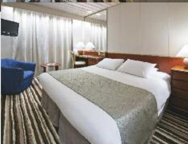
Double Bed Cabin Ocean View Upper Deck 10