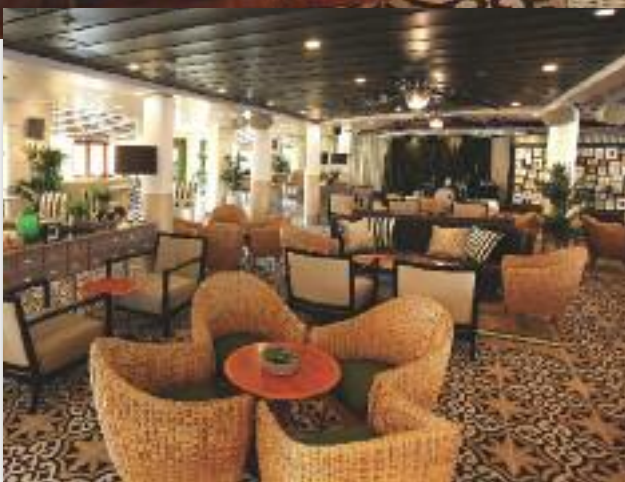
Connexions Promenade Deck 7