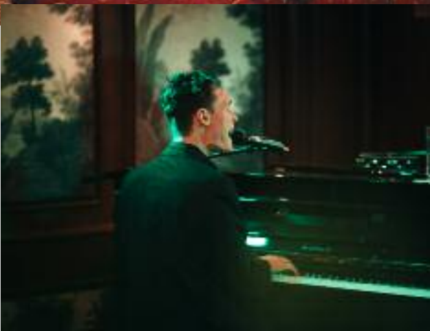
Palladium Show Lounge Promenade Columbus Decks 7 & 8