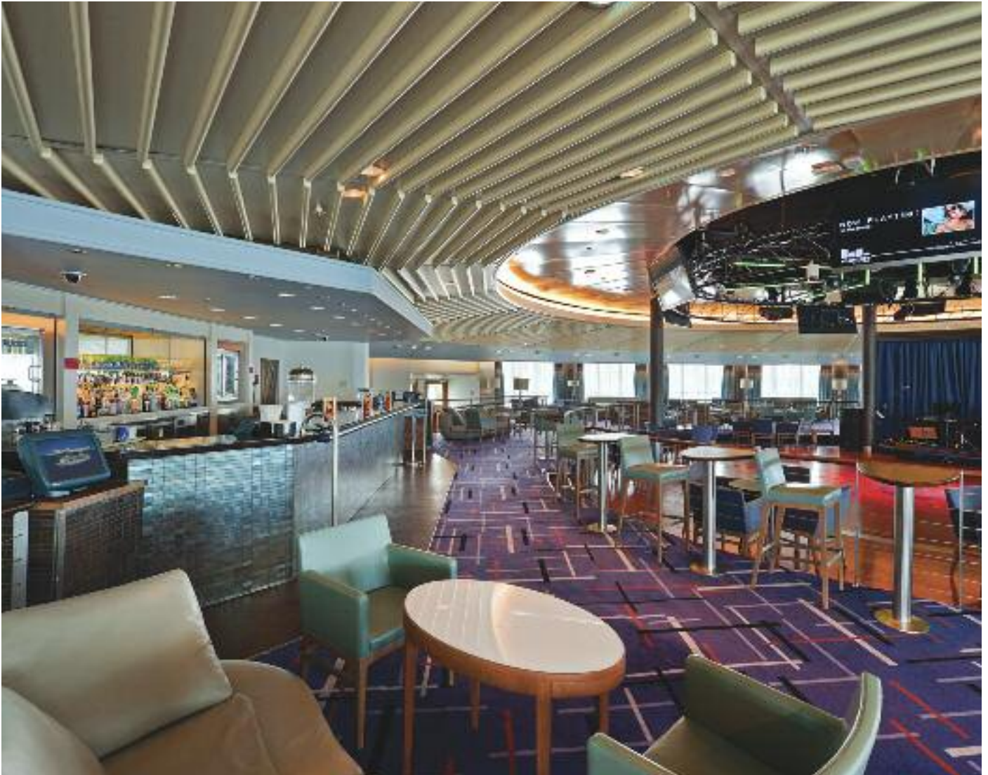
Dome Observatory & Nightclub Sun Deck 14