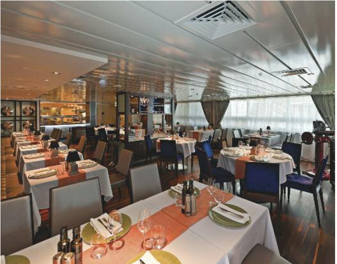
The Grill Lido Deck 12