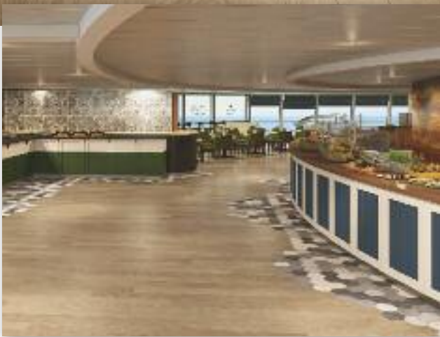
Plantation Bistro Lido Deck 12