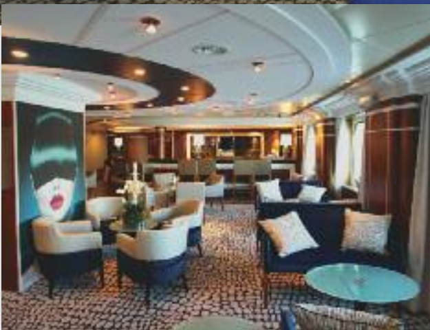
Raffles Main Deck 6