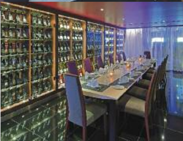
Chef's Table Promenade Deck 7