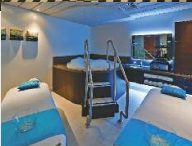
Jade Wellness Centre Caribbean Deck 2 Gym, Day Spa, Hair and Beauty Salon and Thermal Suites