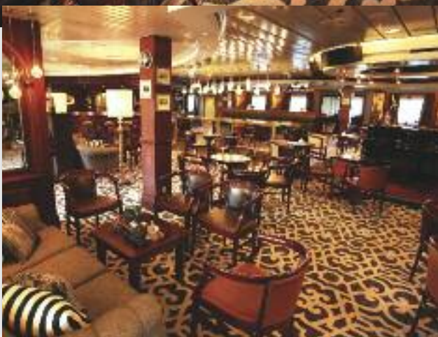
Captain's Club Promenade Deck 7