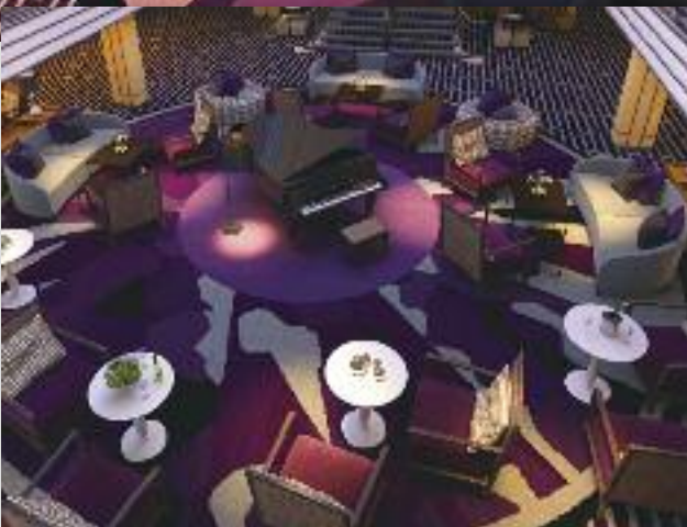
Atrium Deck 5,6,7