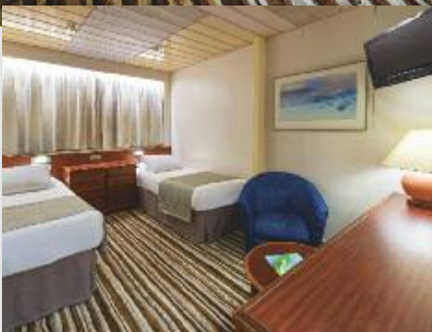
Two Bedded Cabin Ocean View Main Deck 6