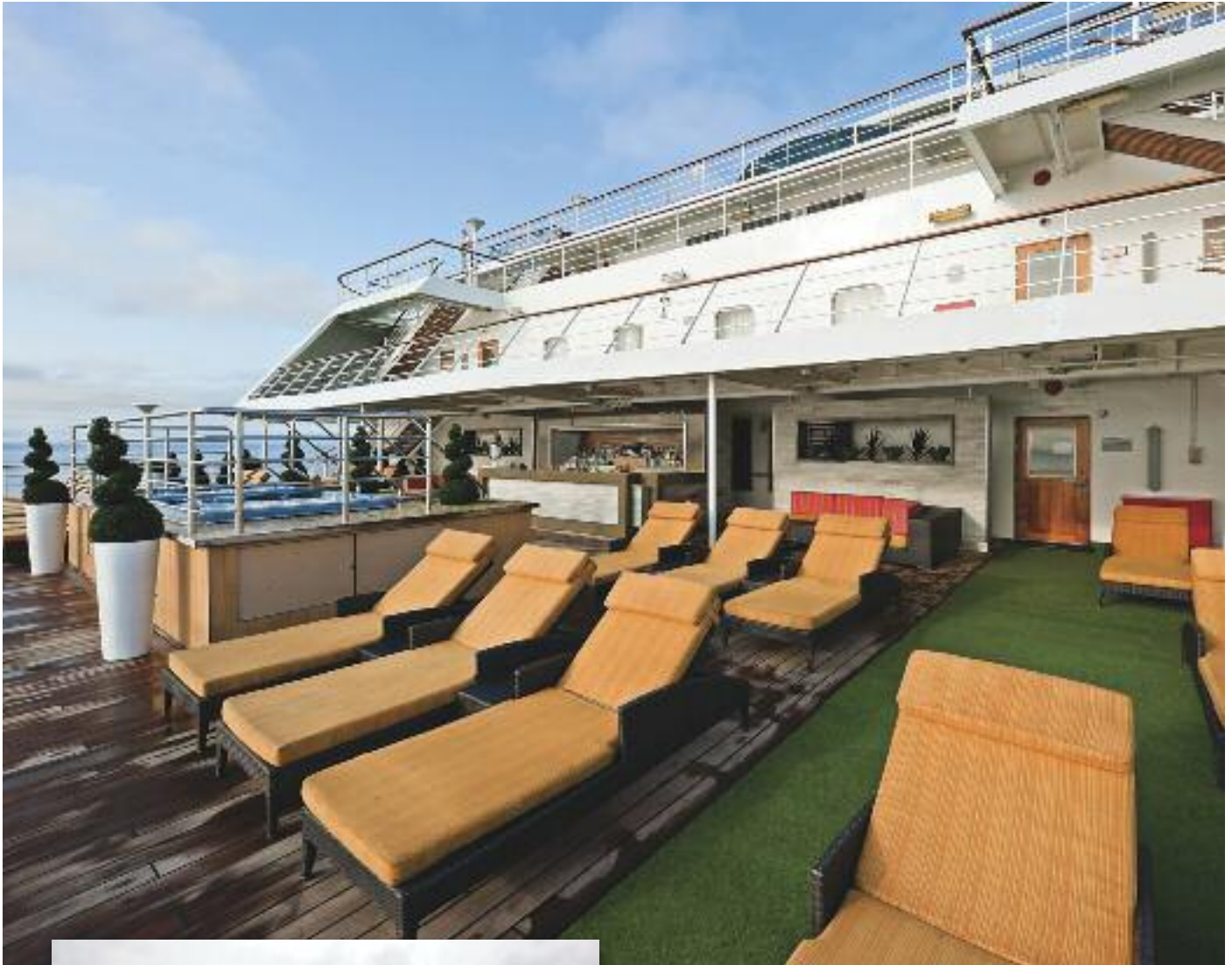
Club Oasis Bar Navigator Deck 8