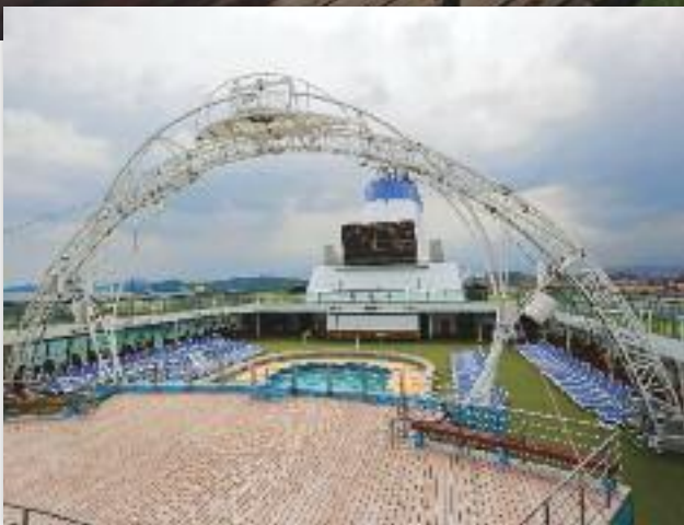
Poolside with Big Screen Movies Lido Deck 12 & Sun Deck 14