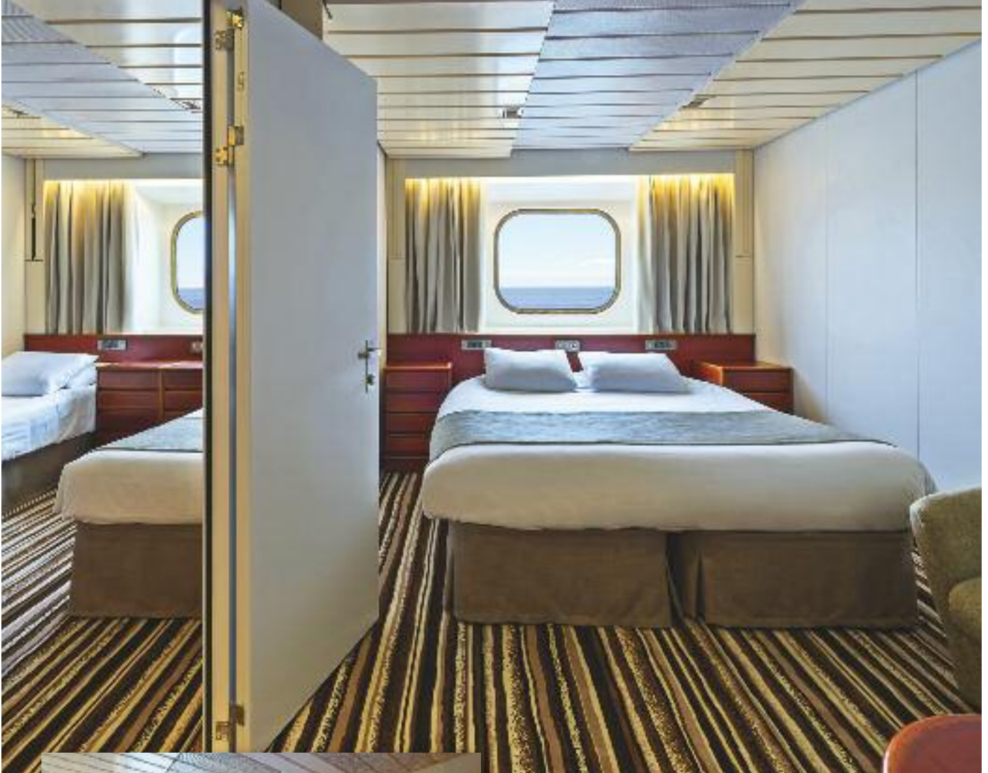
Double Bed Cabin Ocean View - Interconnecting cabin