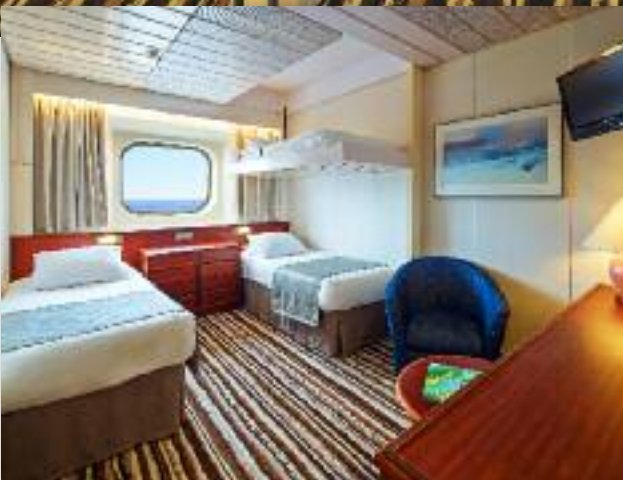
Twin Bedded Cabin with 'Fold - Away in Ceiling' Pullman Berth Boat Deck 9